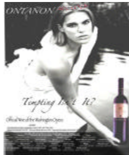
Print ad designed for the Ontañon wine company. The ad appeared in The Washington Opera magazine.

Our design studio can work with your organization to apply the right mix of creativity and professional appearance to your website. In addition, we can also provide full marketing design, including business cards, newsletters, letterhead and any other tools your business requires to promote its image. This includes print ad design.